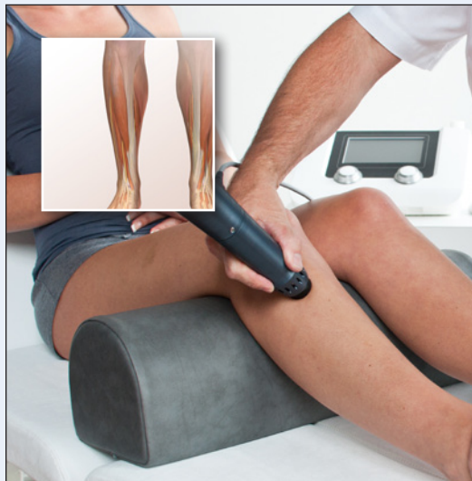
PERIOSTITIS / SHIN SPLINT (CONDITION AFTER OVERLOAD)