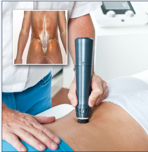
MYOFASCIAL TRIGGER POINT THERAPY E.G. BACK