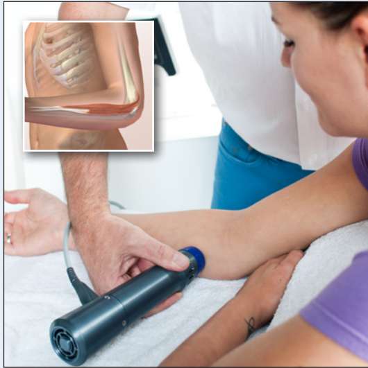
RADIAL AND ULNAIR EPICONDYLITIS

Endopuls 811: Radial shockwave therapy, mobile, long life, easy maintenance, clear touchscreen display