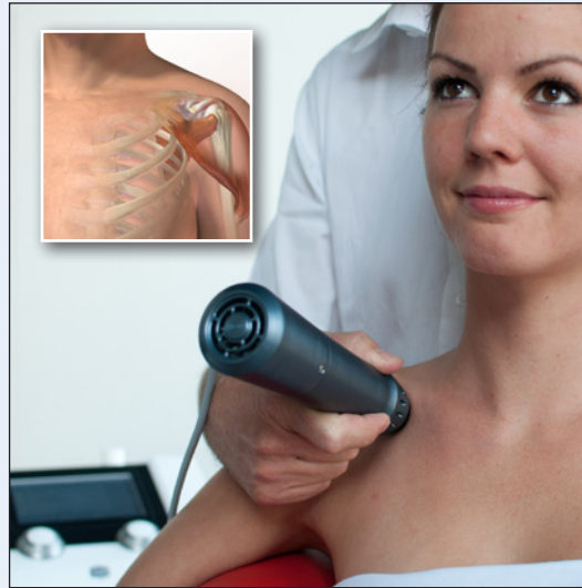
TENDINITIS OF THE SHOULDER / SHOULDER PROBLEMS