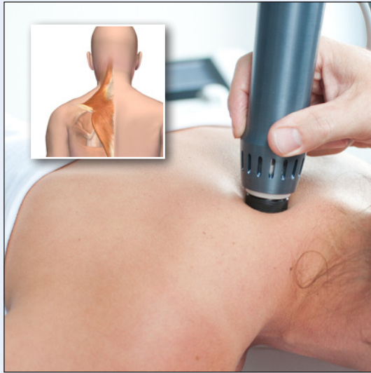
MYOFASCIAL TRIGGER POINT THERAPY E.G. NECK

Endopuls 811: Radial shockwave therapy, mobile, long life, easy maintenance, clear touchscreen display